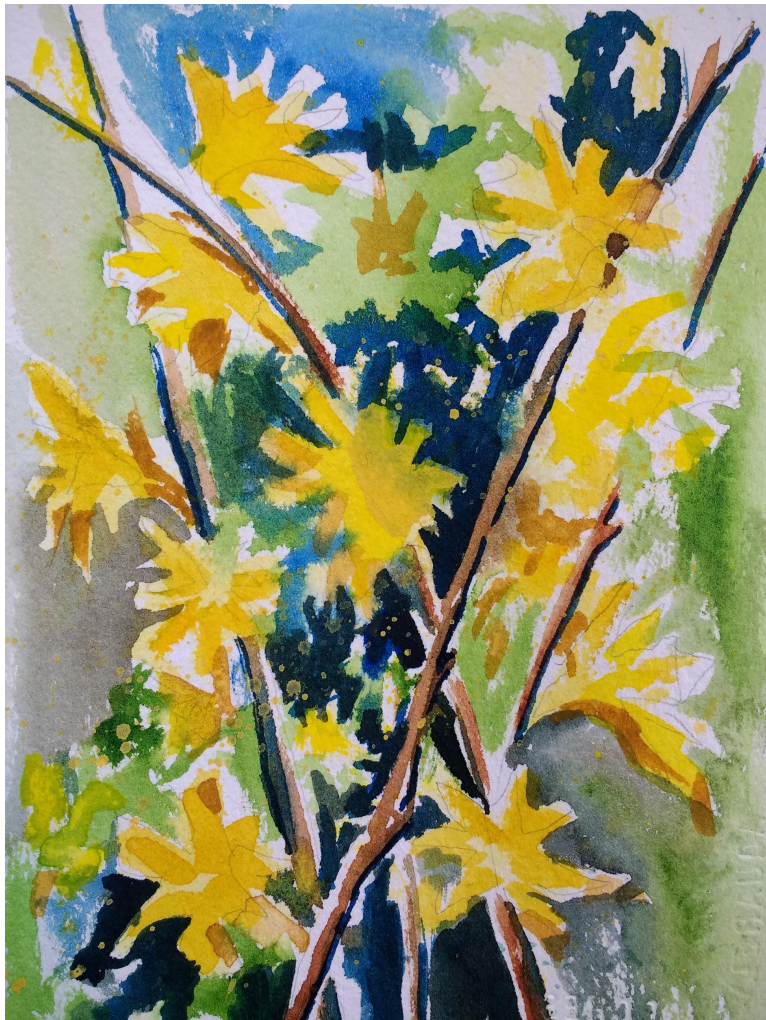
Some spring flowers