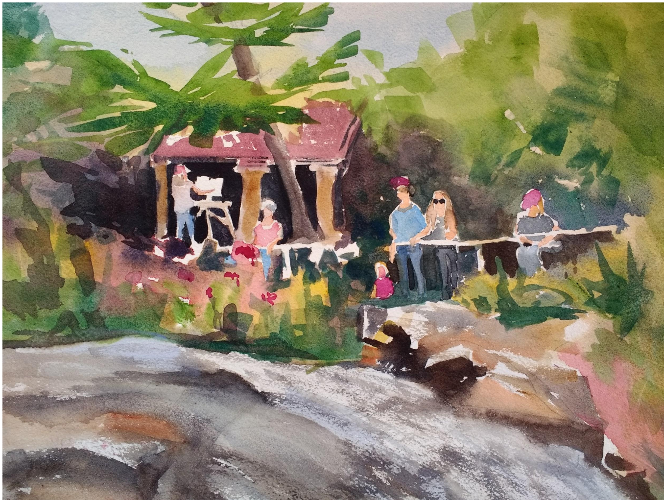
At Chittenango Falls State Park 11 x 15 inch watercolor

Painting on location with my friends. Artists call this painting “en plein air”. It’s french for painting outside. Lots of art terms are in french because the center of the art world used to be Paris.