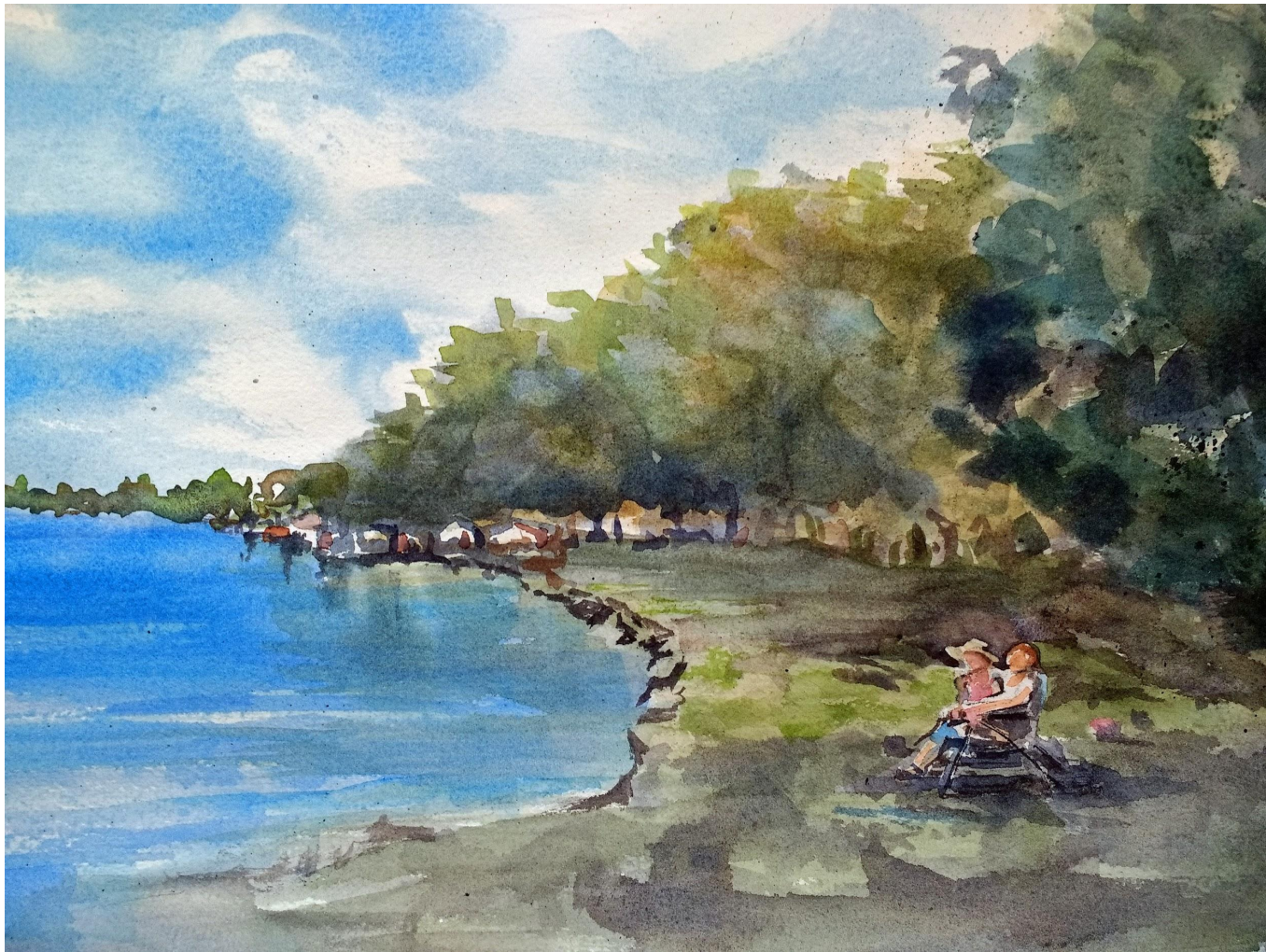
Picnic in the Park 11 x 15 inch watercolor

This is a view of Deauville Island at Emerson Park.