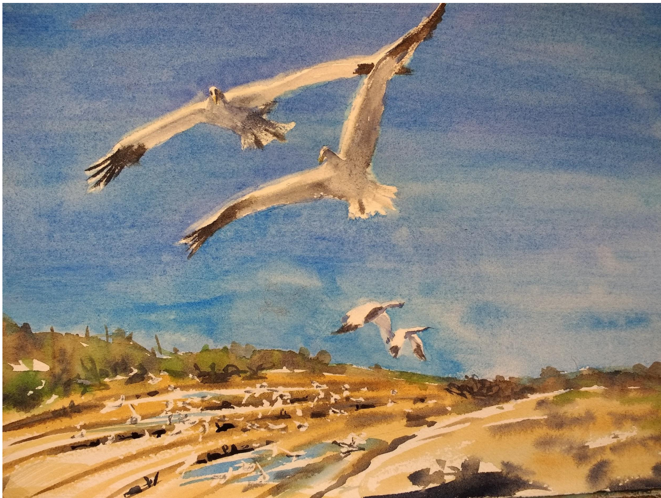
Snow Geese # 2 11 x 15 inch Watercolor

As I was driving through Cato I saw a huge flock gleaning leftovers from a wheat field.