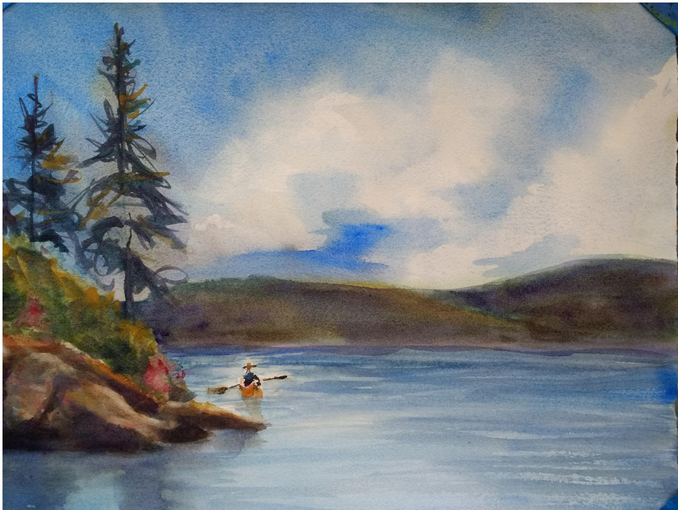
Rounding the Point 11 x 15 inch watercolor

The wind came up while I was paddling on Woodhull lake. I was able to hide from it in the lee of an island.