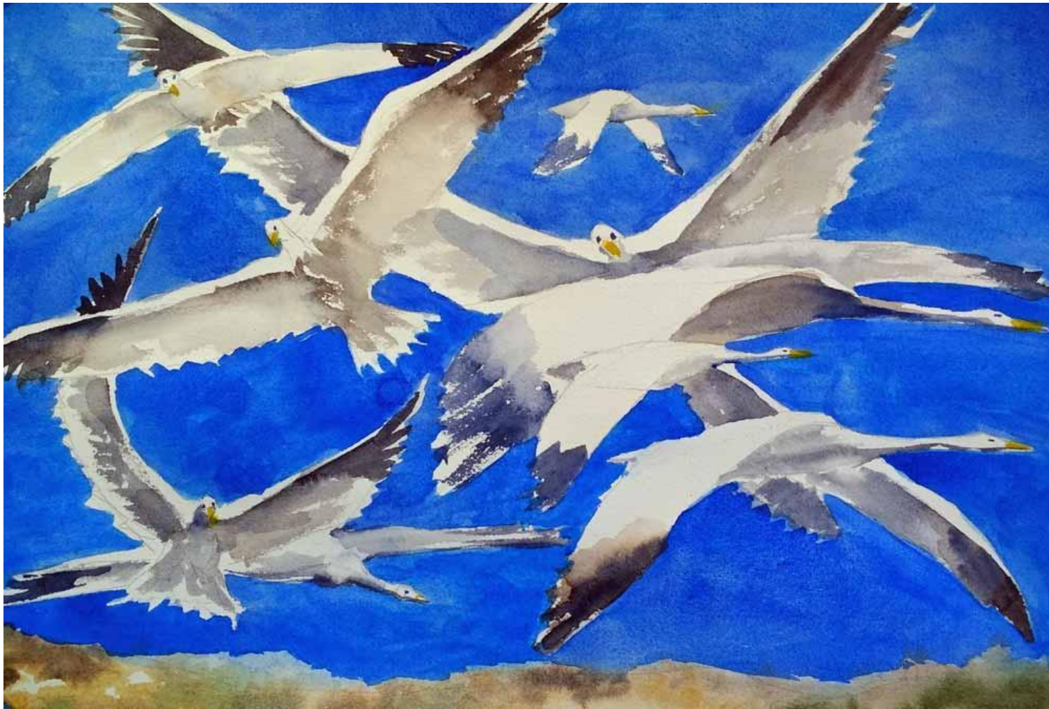
Snow Geese #1 11 x 15 Watercolor

We are on the Atlantic Flyway. In the spring flocks of snow geese pass through our area on the way to the arctic.