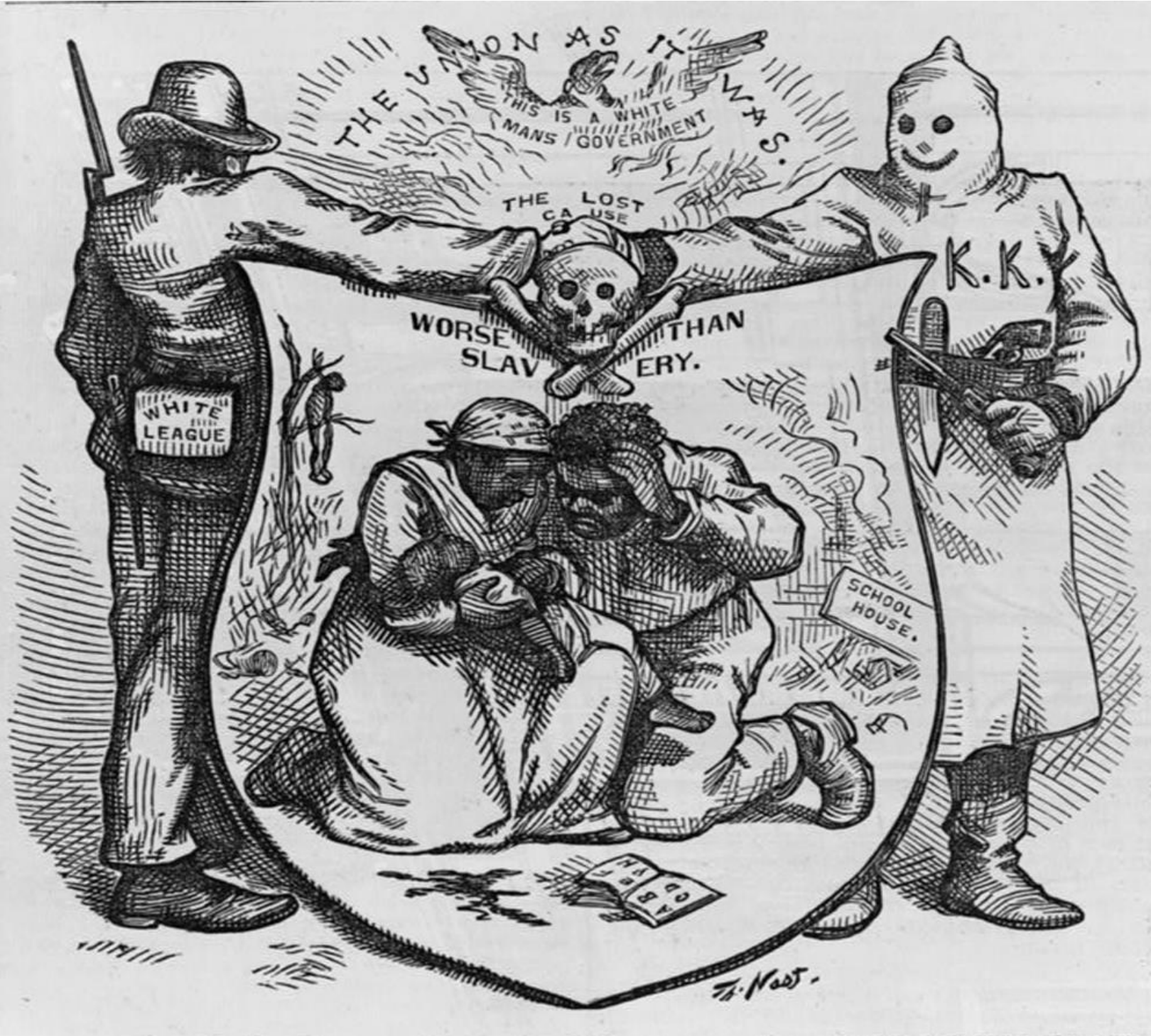
Nast, Thomas, "The Union as it was, The lost cause, worse than slavery," 1874